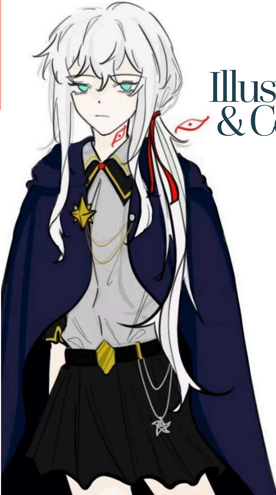
Illustration & Comics

CAMBRIDGE SCHOOL OF VISUAL & PERFORMING ARTS